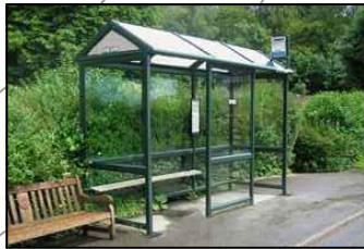
Similar Arun Bus Shelter